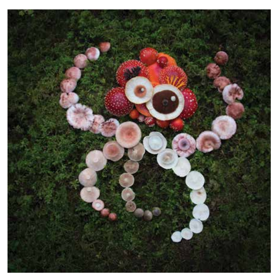
Ilmatar's son, our Grand Shaman Väinämöinen, calls the magic of the oceans for help - and look, a hero starts to rise from the water. Väinämöinen isn't impressed, though. This hero is too tiny, the size of a thumb, and surely too weak.