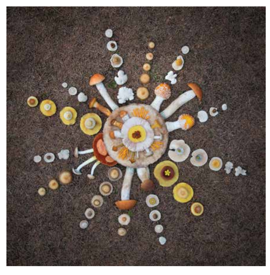
But the tiny hero grows into a mighty giant, who Strikes down the tree with one swing of an ax. And so the light returns into the world.