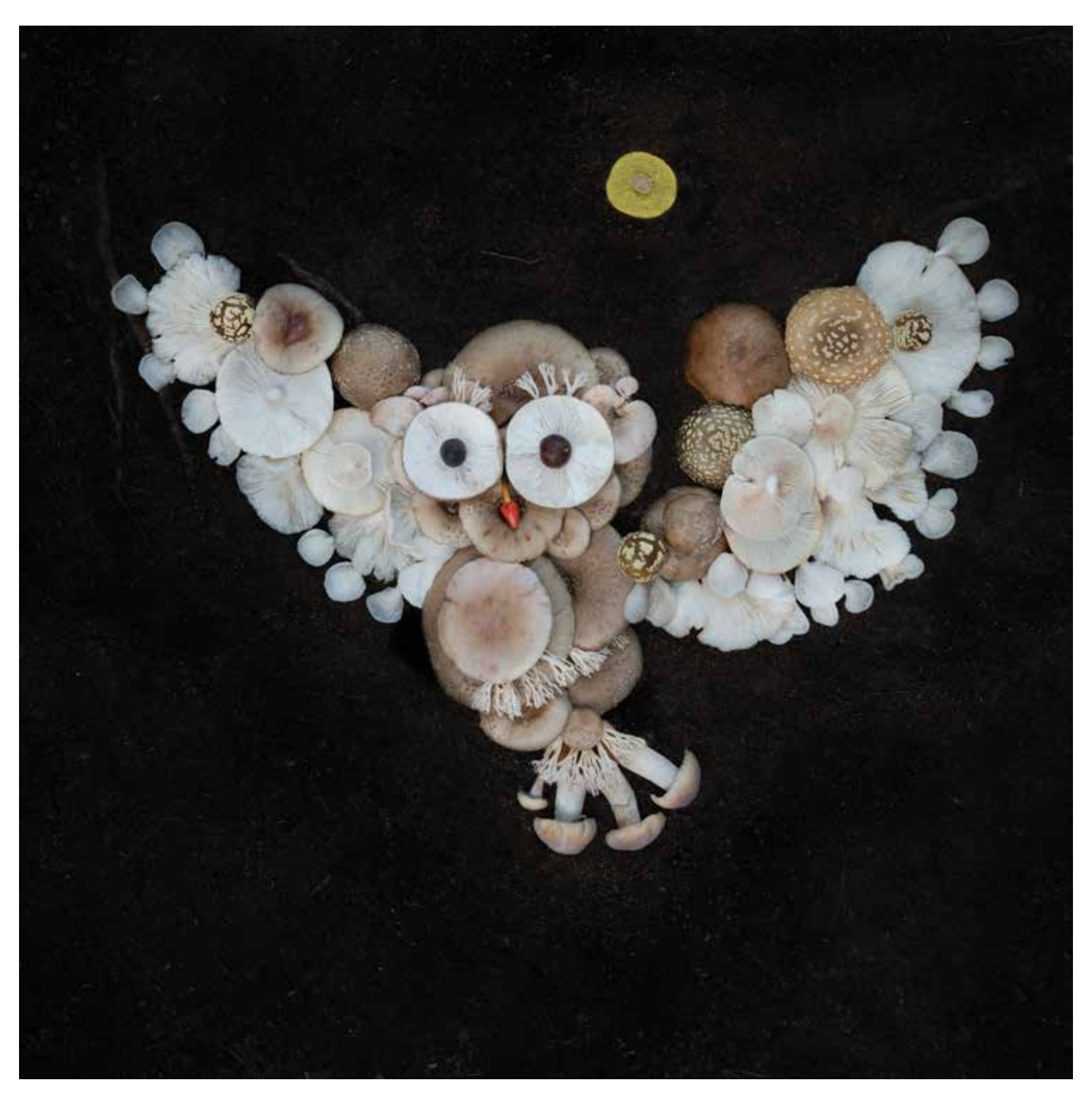
I Only Sing At Night – 2019