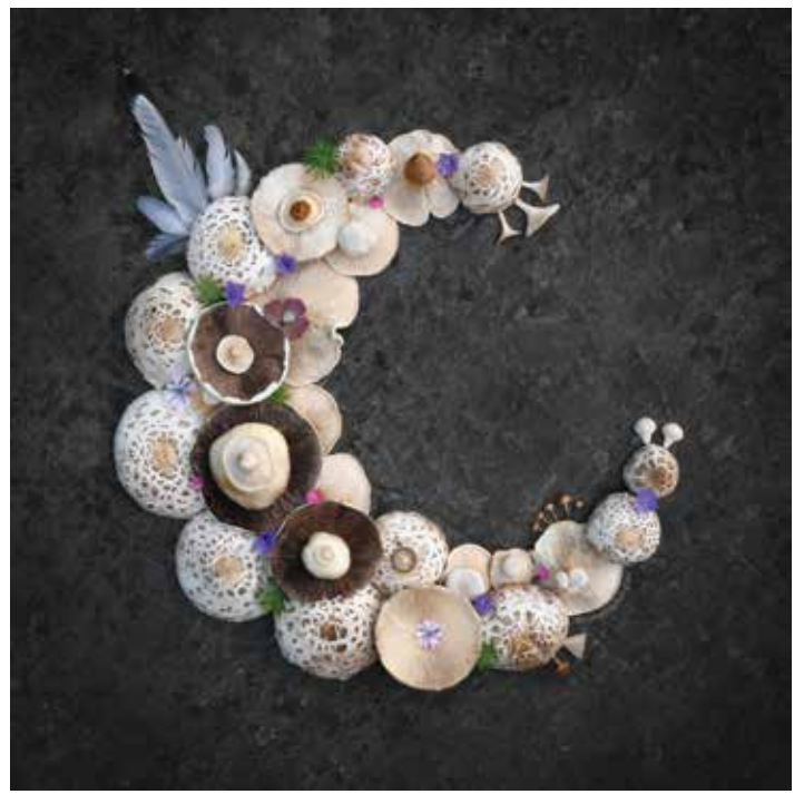
Mother Moon – 2019